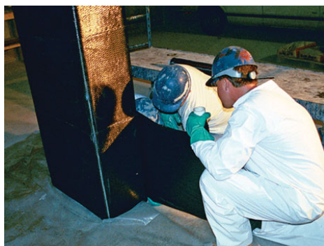
CFRP column wrapping technique

Carbon Fiber Reinforced Polymer (CFRP) will be used to implement the seismic reinforcement works under the SMP scope.