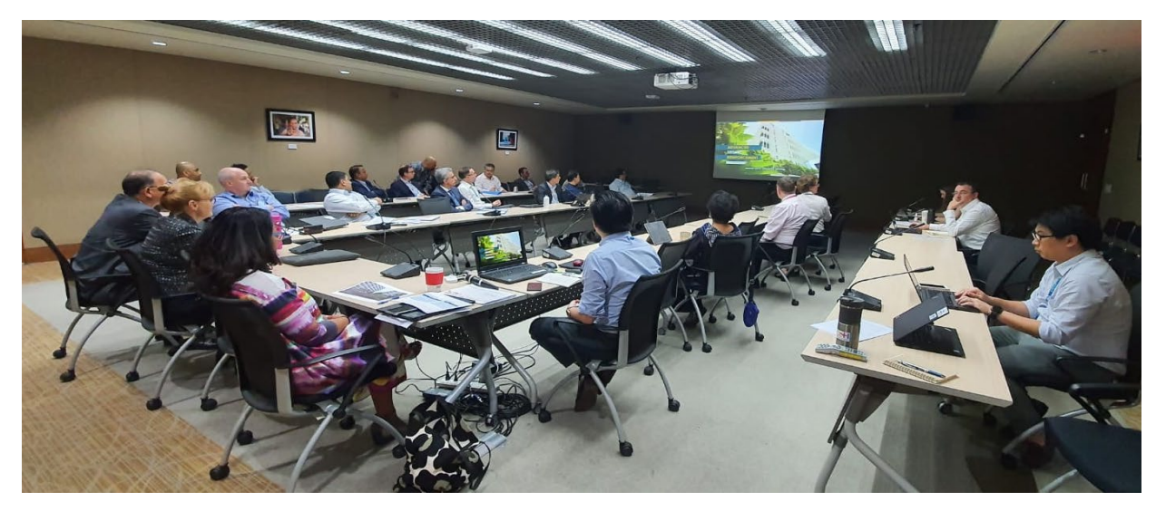
Budget Workshop for Agencies, Funds, and Programmes

The first quarterly meeting of the SMP Stakeholder Committee took place in February 2020. This was the first meeting to be convened since the revision of the Committee Terms of Reference (TOR) in October 2019, to facilitate broader participation by including stakeholders not only from ESCAP but also from the Agencies, Funds and Programmes and other groups at the ESCAP premises who will be impacted by the project activities.