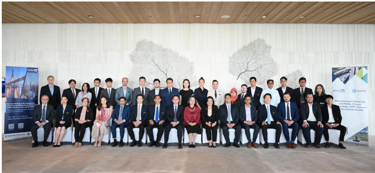
Seventh Meeting of the Infrastructure Financing and Public-Private Partnerships (PPP) Network of Asia and the Pacific

ESCAP co-organized the Seventh Meeting of the Infrastructure Financing and Public-Private Partnerships (PPP) Network of Asia and the Pacific from 15 to 16 June with the Public-Private Partnership Promotion Bureau of State Enterprise Policy Office (SEPO) under the Ministry of Finance of Thailand, the China Public-Private Partnerships Center (CPPPC) under the Ministry of Finance of China and Asian Development Bank (ADB). The meeting aimed to showcase good experiences and developments on how countries in Asia and the Pacific region can build back better in the post-COVID era through effective infrastructure financing and PPP mechanism. For more information, CLICK .