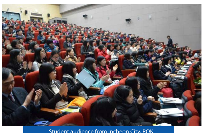
Student audience from Incheon City, ROK.

On a related note, the International Association for Asia Pacific Studies (IAAPS) of the Ritsumeikan Asia Pacific University has an annual conference and provides a comprehensive platform for many scholars and students from all over the world to exchange ideas and views on further development of the Asia-Pacific region. We are pleased to be hosting the 5th IAAPS Annual Conference November next year in Incheon, Republic of Korea.