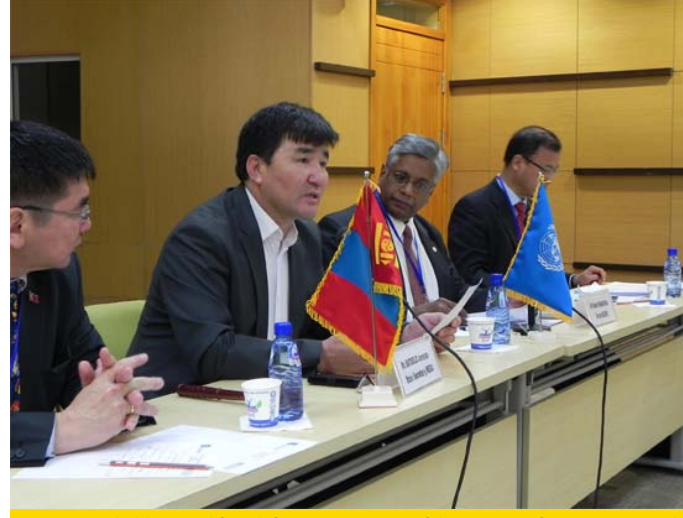
Jamsran Batbold (second from left), State Secretary of the Ministry of Environment and Green Development of Mongolia spoke during the opening session.

The North-East Asian Marine Protected Areas Network (NEAMPAN) was launched at SOM-18. It is the most comprehensive MPA network in the subregion covering national MPAs in all seas of North-East Asia. The Meeting also endorsed new projects on DNA analysis for the conservation of Amur Tigers and a technical and policy framework for transboundary air pollution. It also noted the support from member States on activities including conservation of migratory birds habitats and low carbon city development.