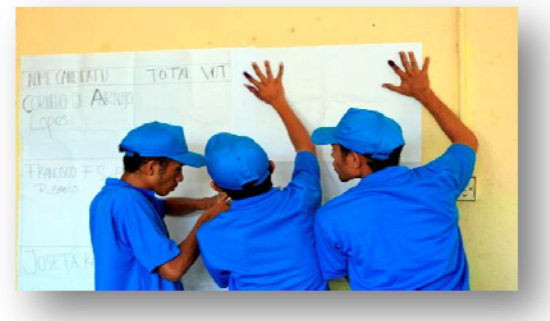
Timor-Leste holds second national village elections under UNMIT supervision